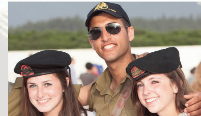
Participants of the March meeting a soldier

You will visit a number of exciting locations and ancient sites, such as Jerusalem, Masada, Tel Aviv, the Golan Heights, the Galilee, the Negev and more. On May 10, Israel's 63rd Independence Day, all of the groups, from around the world, will join thousands of Israelis in this national celebration.